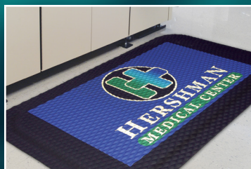
Hog Heaven® Impressions

M+A offers several different logo mat options to display your company's logo and leave a lasting impression on your visitors. Logo mats are recommended for use at entryways, in lobbies, at front desks, or anywhere you want to display your company logo, slogan, artwork, or message to customers/visitors or employees. Photographic quality can be achieved and some styles are available in custom shapes.