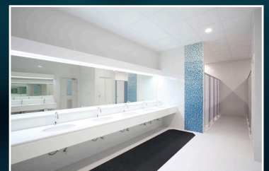
Sure Stride® (Adhesive-Back Matting)