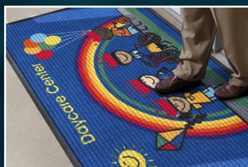
WaterHog Impressions HD®